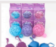
Berry Bra Ball