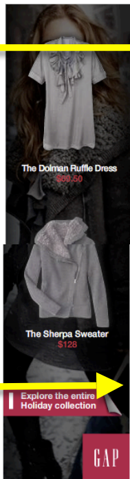
The Dolman Ruffle Dress $39.50