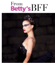
From Betty's BFF Is Natalie Portman hurting her Oscar chances?