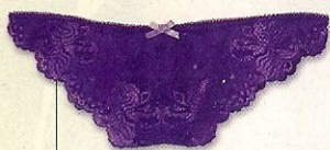
Support and sensuality merge in a matching bra ($70) and panty ($30; both at nordstrom.com ) from Elle Macpherson Intimates .