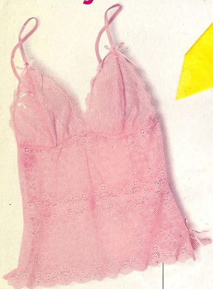
You don't have to bare it all to feel sexy. The proof: this Affinitas Intimates camisole ($25; laurenilva.com ).