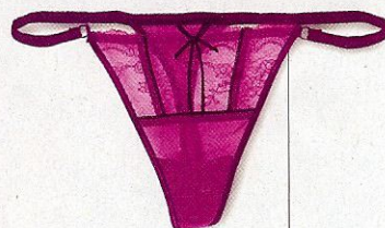
A bordeaux hue adds richness to a DKNY bra ($28) and thong ($12; both at figleaves.com ).