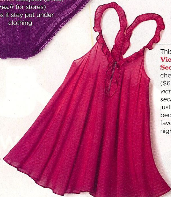
This ruffled Victoria's Secret chemise ($68; victoriassecret.com ) just may become your favorite flirty nightie.