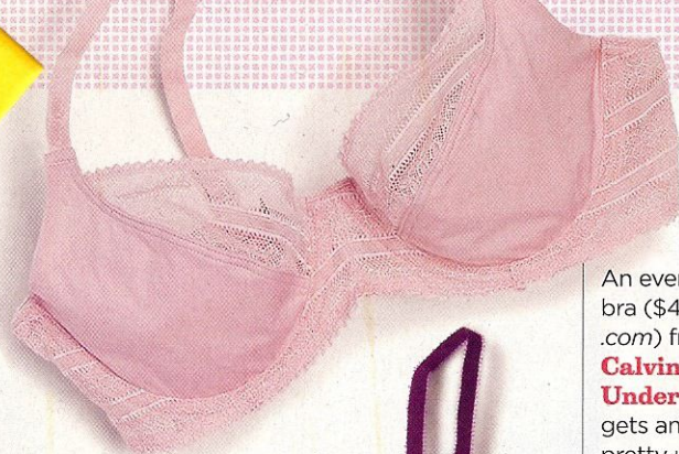
An everyday bra ($40; cku.com ) from Calvin Klein Underwear gets an ultra-pretty update with sheer panels and lace.